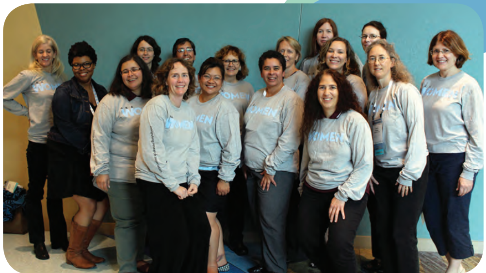
GHC 2014 CRA-W Speakers

The CRA-W mentoring sessions took place on the afternoon of Oct 8th. For undergraduates, CRA-W staffed tables in the Student Opportunity Lab on four different topics: Undergraduate Research Experience,