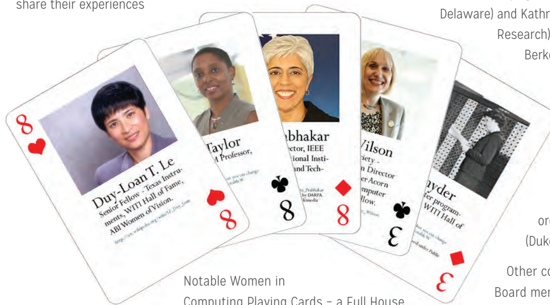
Notable Women in Computing Playing Cards - a Full House