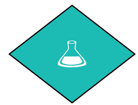
Letters from Other Disciplines It can be hard to find 3-4 CS professors who know you well. It's okay to have letters from faculty in related fields (e.g., EE, Math, etc.)