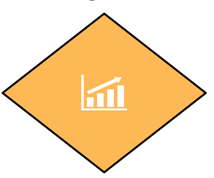
Make Each Letter Count A letter that only says "this student did well in my class" is not very helpful.