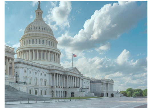
Policy and Governance