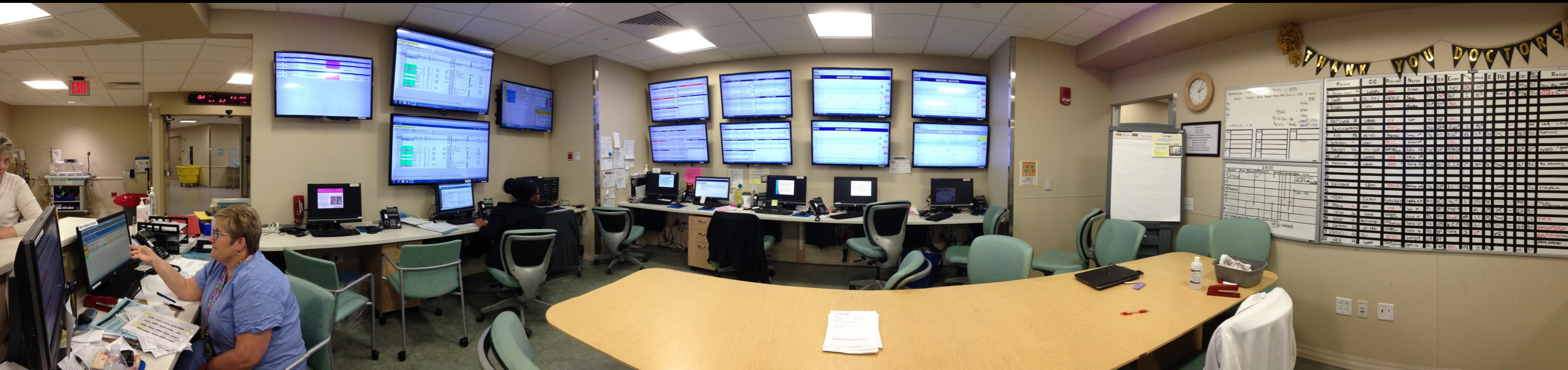
Air Traffic Controller