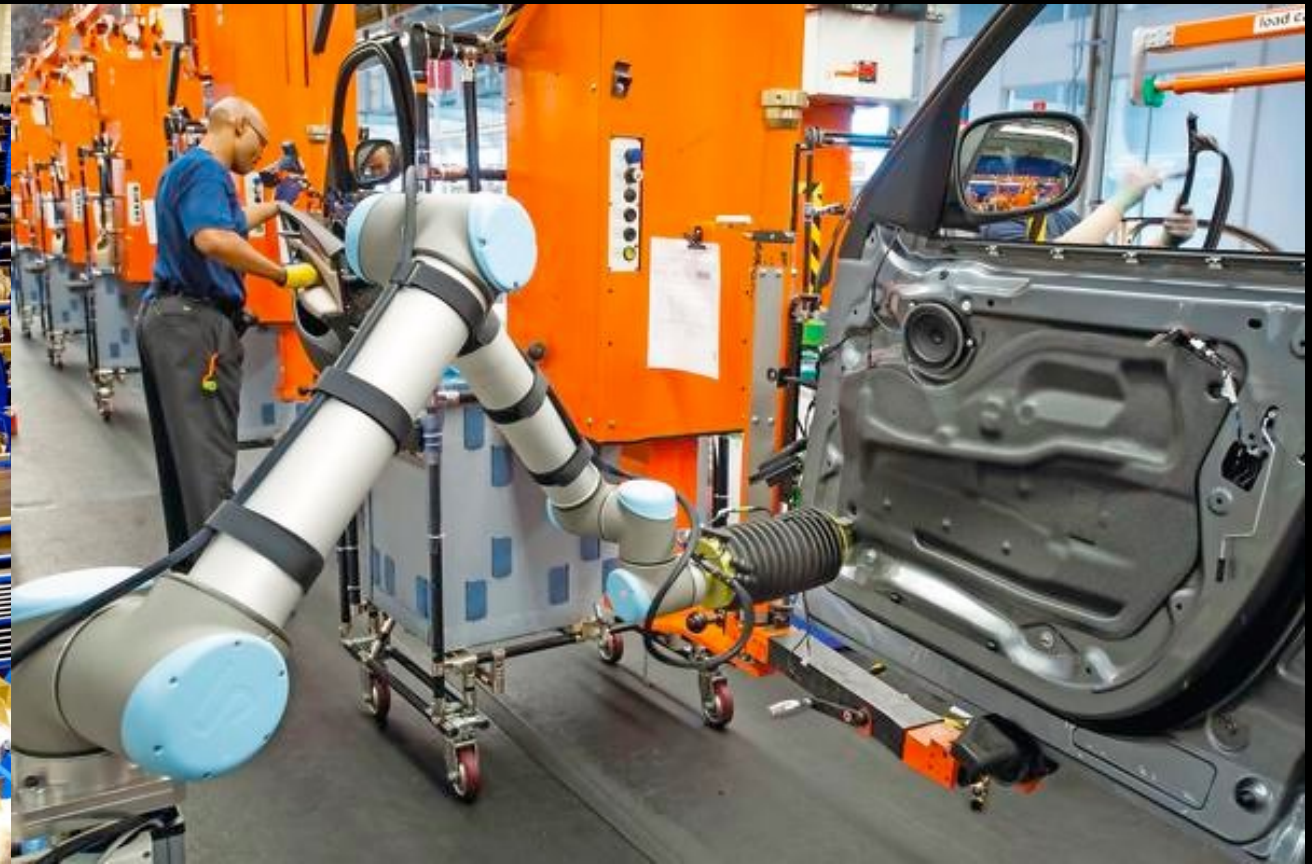
BMW Spartanburg, SC