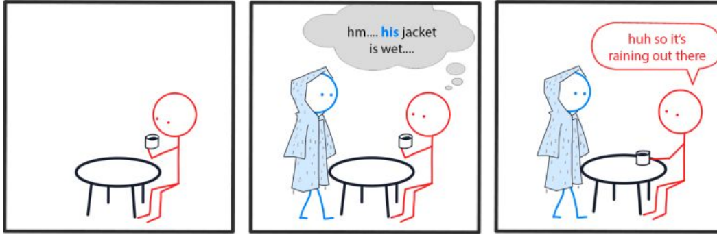
Figure 2: At top, an example of an S1H2 condition used in our first experiment; at bottom, the edited version of that same comic used in a second experiment. Note the thought bubble for clarification.